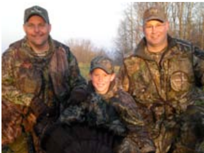
Youth hunt in Kentucky to be aired on the next WoodHaven Spring Time Victories video project