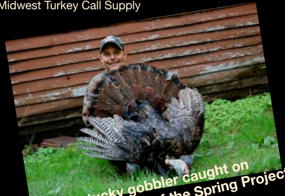
Wet Kentucky gobbler caught on camera for "Lord of the Spring Project"