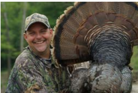
Another successful hunt in Kentucky on film taken late season as breeding is slowing down but this dominate long bread was still on the prowl.