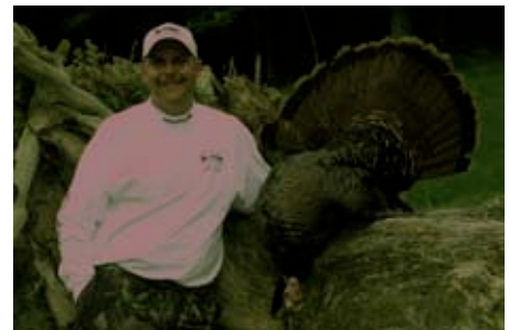
Another 4 year old educated Ohio public land gobbler, taken on a beautiful spring morning. Advanced tactics on tough gobblers is covered in Brad's presentation.